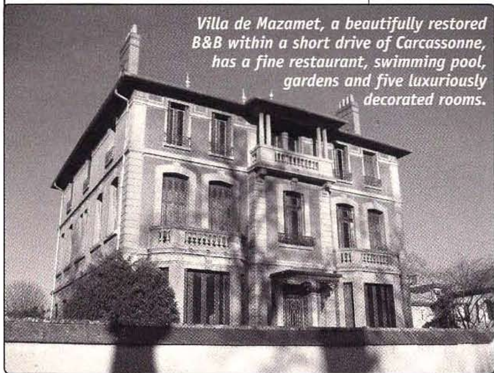
Villa de Mazamet, a beautifully restored B&B within a short drive of Carcassonne, has a fine restaurant, swimming pool, gardens and five luxuriously decorated rooms.

(Filed from London by Phoebe Phillips; additional research by George Woodward)