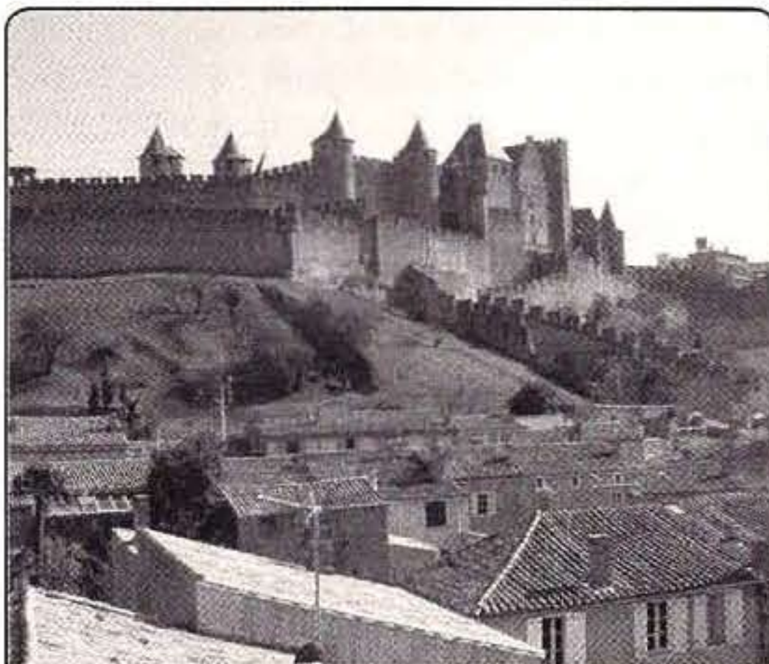
The medieval walled town of Carcassonne, in the south of France, is a magnet for lovers of French history. Allegedly it was the inspiration for the setting of Walt Disney's "Sleeping Beauty." The town also appeared in the 1991 Kevin Costner film, "Robin Hood: Prince of Thieves."

You can sleep at the Hôtel du Pont Vieux (32 rue Trivalle, ☎ 011-33-468-252-4999, www.lacitedecarcassonne.fr) for $95/night, incl bkfst. Just a few minutes from the Old Town walls, the country-style rooms are small, comfortable and air-conditioned. The roof terrace and gardens (open for bkfst and drinks) have views over the historic area. TIP: Ask for room #6 or #11 — both open onto the garden.